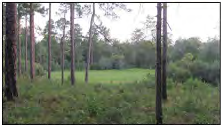
Figure 3. Suitable gopher frog breeding pond and ecotone.

Gopher frogs occur throughout the Florida Panhandle and Peninsula north of the Everglades. Throughout the species' range fire is an important natural disturbance. Historically, lightning-ignited fire maintained suitable habitats for gopher frogs. Prescribed fire practices are currently important to mimic the effects of this disturbance. Fire may prevent the encroachment of woody plants while wetlands are dry. Fire suppression may create barriers to gopher frog dispersal (Roznik et al. 2009, Roznik and Johnson 2009b). Mechanical and chemical treatments can be used to restore and maintain wetlands that have been historically fire excluded. Further