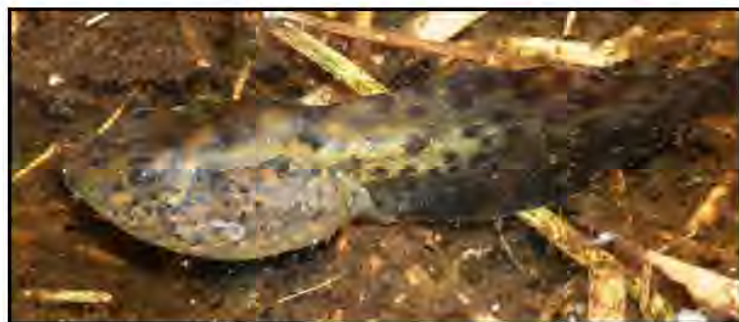
Figure 1. Late-stage gopher frog tadpole.

Gopher frogs ( Lithobates capito ; formerly Rana capito ) are large, stout-bodied frogs in the family Ranidae with a complex life history. They are primarily a sandhill species that rely on intact, connected upland and aquatic habitats. Notably, they are a gopher tortoise burrow commensal species. Adult gopher frogs are heavily spotted with brown or tan blotches over a cream background. Bronze dorsolateral folds extend from behind the eye to the waist. Adult frogs are typically 7 – 11 cm (2.8 – 4.3 in.) in length. Tadpoles (Figure 1) are greenish gold in coloration and have scattered dark spots along the body and tail. Gopher frog tadpoles are difficult to distinguish from other Lithobates species. Historically, two subspecies of gopher frog were thought to occur in Florida, separated by the Apalachicola River; however, current evidence suggests Lithobates capito is a singular species east of the Mississippi River (Young and Crother 2001, Jensen and Richter 2005, Frost et al. 2006). Gopher frogs usually live for 4 – 5 years, but longevity may exceed 10 years (Richter et al. 2003).