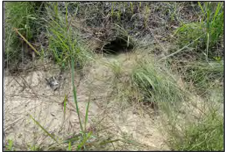
Figure 2. Gopher tortoise burrows are an important landscape feature for gopher frogs.

Gopher frogs use two distinct habitat types during the non-breeding, breeding, egg, and larval parts of their life cycle. Non-breeding adults and juveniles use upland habitats with well drained sandy soils that typically support gopher tortoise ( Gopherus polyphemus ) colonies. Gopher frogs can persist in areas where gopher tortoises have been extirpated and will use other refugia types, especially in the Florida panhandle. Examples of habitat types that support gopher frogs include longleaf pine-xeric oak sandhills, xeric hammock, mesic flatwoods, upland pine forest, mixed hardwood-pine communities, scrub, scrubby flatwoods, dry prairie, and disturbed habitats (Enge 2019).